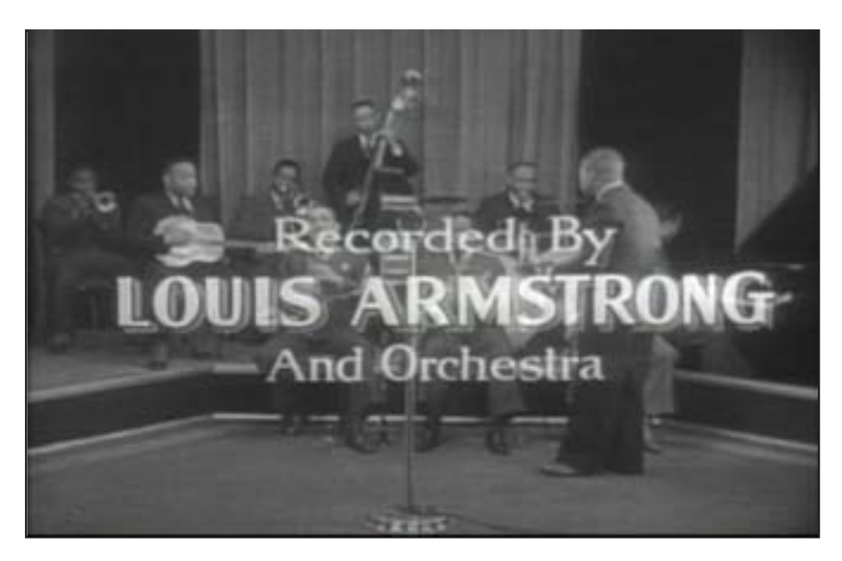
I'll Be Glad When You're Dead, You Rascal You (Fleischer, 1932)

I'll Be Glad When You're Dead portrays African Americans as "contemporary savages" whose music quickly changes from stereotypical jungle rhythms (beating drums) to a much more modern and swinging sound, though one still understood to be primitive in origin. The Fleischer cartoons were not alone in fostering images of the emergence of jazz from the savage hinterland as all the major studios reproduced and circulated this