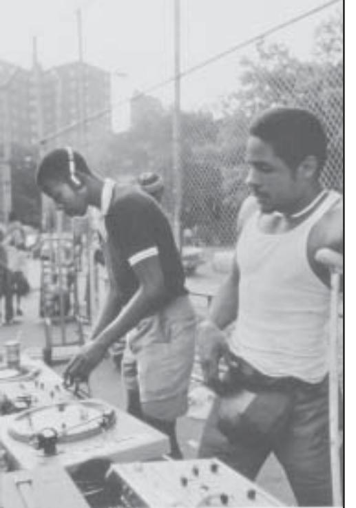
New York DJs