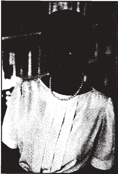
Eileen Southern (1920-2002)