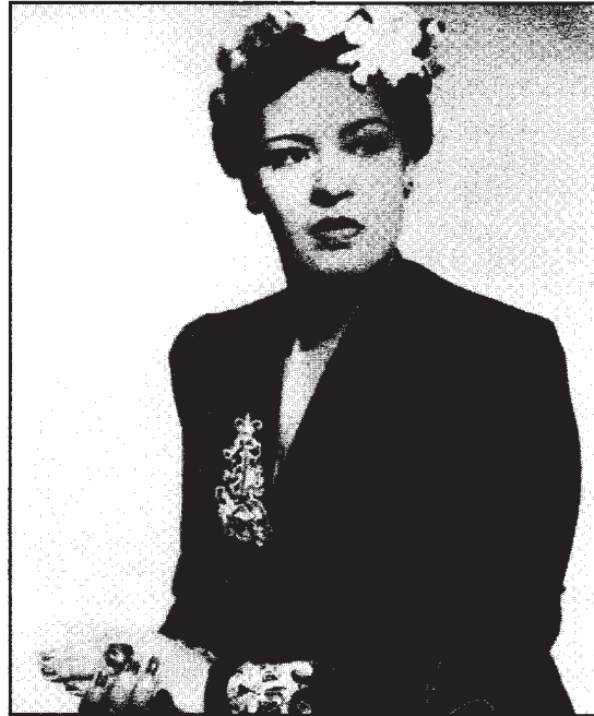
Billie Holiday, early 1940s

texts, that their "real" autobiographical stories are the ones they shared in public, even when it is unclear what control they had over their material. This is another version of the "just singing their lives" trope that so often undercuts the agency of female performers. Overall Davis's analysis needs to be more nuanced in thinking through and challenging the time-worn dualities that have marked the "bad boy/victim girl" discourses of blues and jazz while ignoring race and gender politics.