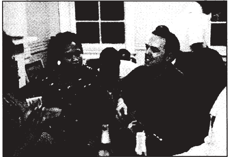
Alan Lomax with Georgia Sea Island Singers