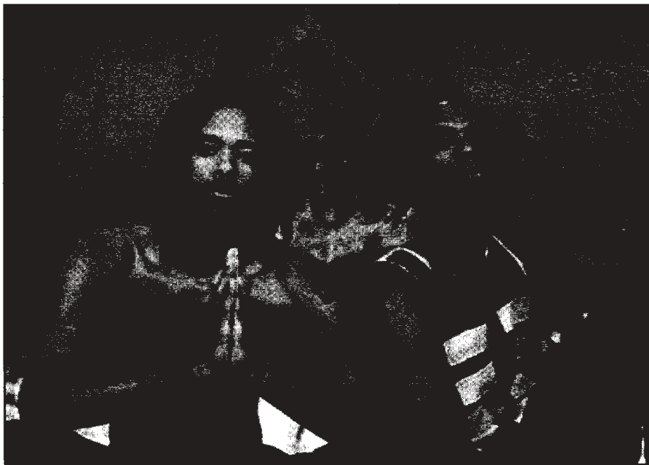
dead prez: Stic. and M1