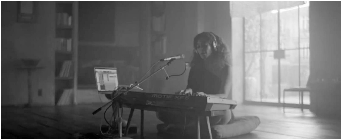
Screenshot from Beyoncé’s “Sandcastles”

But that first shot of Beyoncé-as-recording-musician sticks, and it re-writes a simple understanding of what might otherwise have been understood as sincere vocal failure. Let me return to the voice, then—Beyoncé’s voice as it breaks over the words “your face” and “what is it about you.” As she slides up to the first b-flat of “what” in full chest voice. As she flips to head voice when she pops up to it again to end the phrase on “you.” As instead of clear tone and pitch she rasps, we hear the grain of her throat, the constriction of her vocal cords. It’s visceral, it’s affective, it wrenches attention to the materiality of Beyoncé’s body, and forges a connection between that body and the body of her listener.