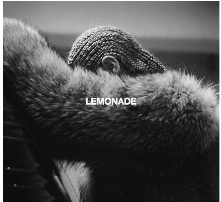
Album Cover of Beyoncé’s Lemonade

Like so many of her actions and performances across the 2010s, Beyoncé’s 2016 visual album Lemonade seemed to compel response—an ocean of tweets, a deluge of think pieces. As a visual album, Lemonade is a bold political treatise. It’s a dreamy, poetic fantasy. It’s a dense tapestry showcasing the power and beauty of myriad forms of black womanhood; it weaves together afrodiasporic identities, traditions, images, sounds, spirituality, stories. It flows nimbly through genres, from gospel and trap to country and rock. This exploration is a kind of history-making too, a reminding and a reclaiming of sonic space alongside guitars, harmonicas, drum kits—a reminder that country and rock have their roots in black creativity and cultural production. Lemonade blurs the universal and the unique, the personal and the collective.