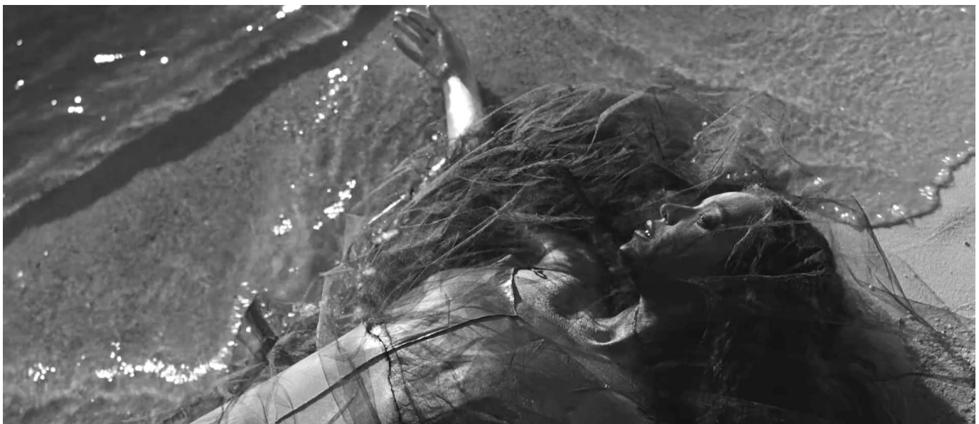
Screenshot from Beyoncé’s visual album Lemonade

The song “Sandcastles” comes at the pivotal turning point in this trajectory—“Forgiveness”—with lyrics that speak of the pain of failed relationships; the song opens “We built sandcastles that washed away,” and a recurring refrain laments that “Every promise don’t work out that way.” As a viewer I might have expected to see an angry, bitter, or impassioned Beyoncé—I would have anticipated that her body’s outward appearance conform to the striking and audible fault in her voice, the rasp and almost-scream suggesting a surfeit of emotion, an excess, a loss of control. The actual visual for “Sandcastles,” however, surpasses and complicates these expected images. The section of the Lemonade film entitled “Forgiveness” begins—and indeed, the viewer is at the water.