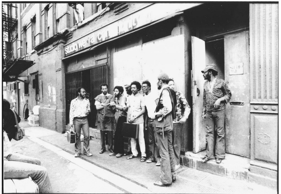
Musicians outside Studio We in New York, c.1973