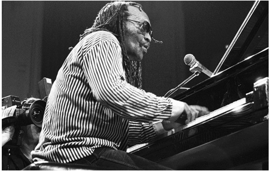
Cecil Taylor performing in 1987

There are many who knew these three gifted people far better than I, and in different circumstances. However, these seemingly minor experiences took on special significance for me as I first read of their passing. I know I am a better teacher, scholar, and listener because of my acquaintance with these fellow travelers, and for that I will continue to be grateful.