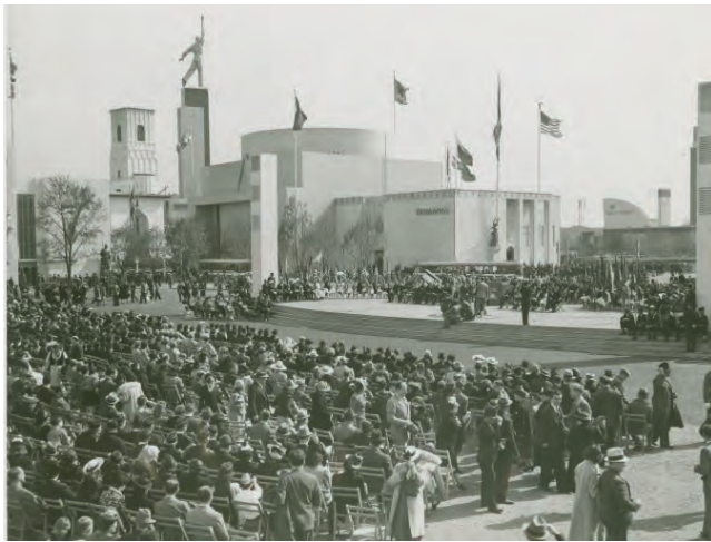
Romania Day at the New York World's Fair, 1939-1940