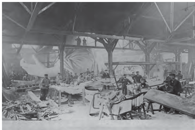
“Constructing the Statue of Liberty, 1882”