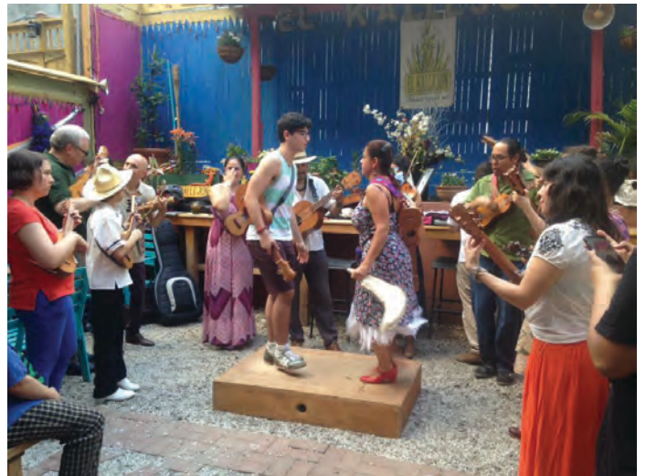
Fandango at El Kallejon Lounge in East Harlem

Despite the dispersed nature of the Mexican population, there have been efforts to create social networks and encourage cultural activity across the city. For instance, the Mexican Consulate supports social organizations such as soccer clubs that provide men and women team networks and access to competition and organized games. 2 For musical activity, the Ballet Folklórico Mexicano de Nueva York and the Mariachi Academy of New York have been educating and entertaining Mexican New Yorkers for decades. Aside from mariachi and ballet folklórico, which are closely connected to the Mexican state's national canon, there are also active commercial scenes of Mexican music ranging from DJ parties that feature cumbia to norteña and banda concerts. However, because of the dispersed nature of New York's Mexican population, the limited reach of institutions like the Mexican Consulate, and the current hostile political climate toward immigrants, some Mexicans have sought alternative musical