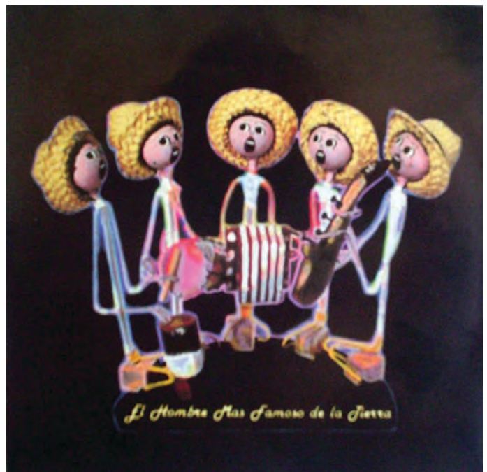
Figure 7: Back cover of Fulanito's CD El Hombre Más Famoso de la Tierra (1997)