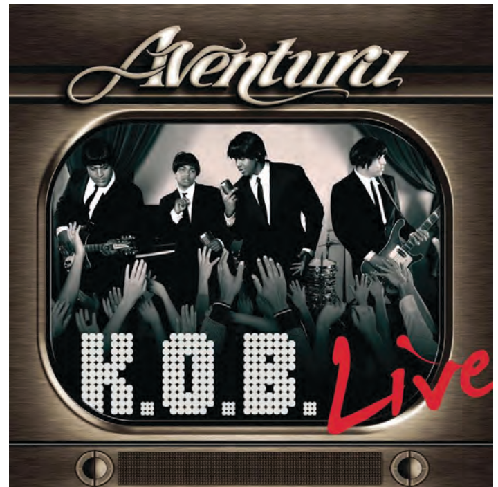
Figure 3: CD cover for Aventura’s K.O.B Live (2006). Note the R&B and Beatles influence in Aventura’s members’ fashion style