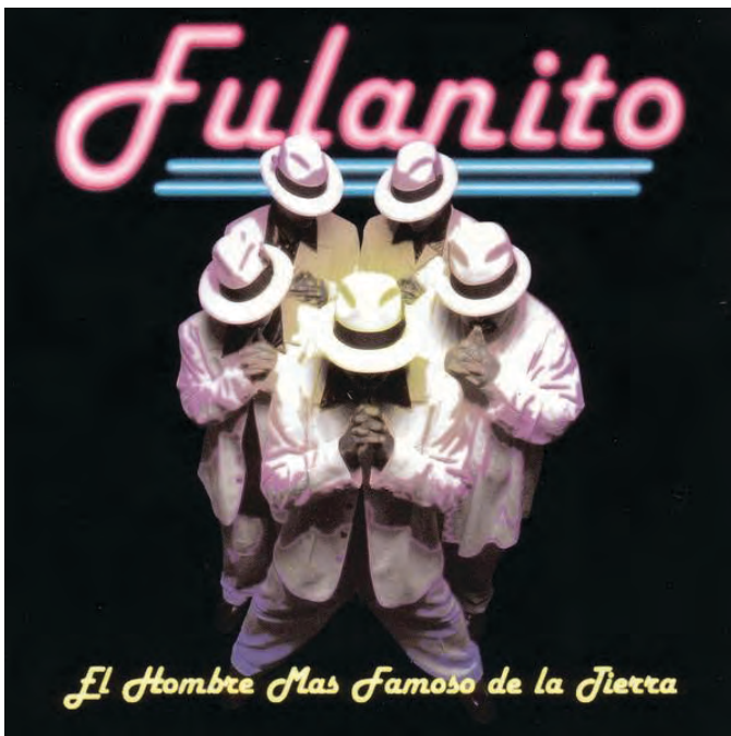
Figure 6: Front cover of Fulanito's CD El Hombre Más Famoso de la Tierra (1997)

Aventura crafted video clips in which they juxtapose references to rural Dominican Republic with New York modern scenes of fancy clubs, drinks, and cars, female models, fashionable attire, and a glamour not accessible by more traditional bachateros. When Aventura became an established group, they collaborated with well-known urban artists such as Nina Sky and reggaetón vocalists Don Omar ("Ella y yo") and Tego Calderón ("Envidia"). In his productions Formula Vol. 1 (2011) and Vol. 2 (2014), Romeo worked with an array of artists, and by his choices we can note his extensive list of both African American, traditional bachatero, and Latino influences. I read these productions as tributes to his multiple influences, but he makes the conscious decision to continue to sing