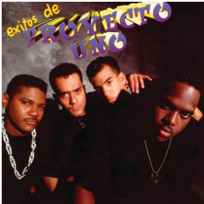
Figure 5: CD cover for Proyecto Uno's Exitos de Proyecto Uno (2007)

executive director of Latin content and programming for Billboard , said that because of demographics changes in the United States where nearly a quarter of American youths are Latino, these youngsters want “musicians who grew up comfortably in a bilingual, bicultural world.” 9 It is important to note that neither Aventura nor Romeo, in contrast to previous Spanish-speaking artists like Ricky Martin and Shakira, have had to crossover by singing