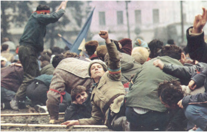
"The Romanian Revolution, 1989"

and of course I didn't." He spent the rest of that year trying to save as much money as he could so that he would be able to immigrate. During tours with the orchestra he took along suitcases of canned food so he could save his per diem. But the gap between the American economy and the fledgling Romanian economy of the 1990s was too great: after a year of effort, he was only able to put aside $700.