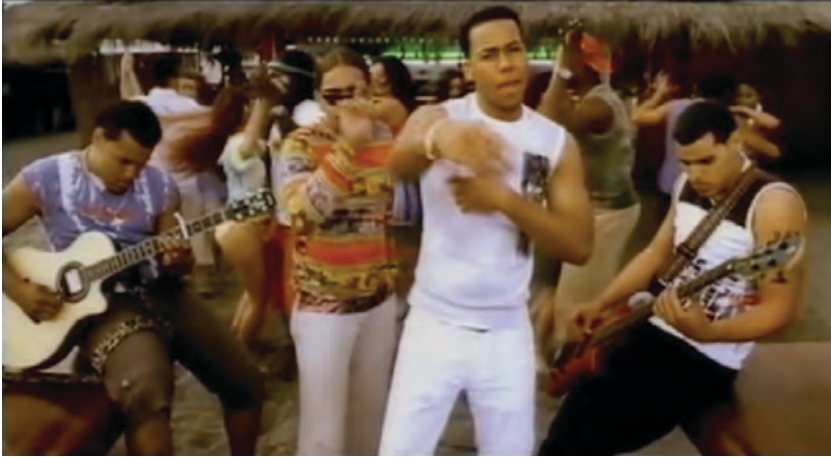
Figure 4: Still photo from Aventura's video for the song "Obsesión" (2002)

As Wendy Roth stated, Dominicans (and Puerto Ricans) have "helped to create a new American racial schema moving their host society away from a dominant binary US schema—which would classify them all as White or Black, based on the one-drop rule—to a Hispanicized US schema that treat White, Black and Latino as mutually exclusive racialized groups." 5 These Latinos feel they belong to two countries, which exist in different temporalities, and feel they belong in the liminal space between black and white racial categories in the United States. Groups like Aventura have also expanded the definition of urban music in the United States to include Spanish-language music, which reinforces an identity that is neither black nor white. Because of their use of R&B and hip hop influences and their similarities to African Americans in attitude and fashion styles, they get played in urban radio stations (see figures 2 and 3). However, Aventura's appeal is not just to an "urban" music audience. Their fashion sense, traditional bachata rhythms, and vernacular language also strongly suggest a rural humble Dominican aesthetic (see figure 4).