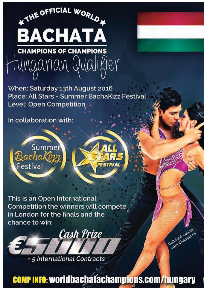
Figure 1: Poster from bachata competition in Hungary