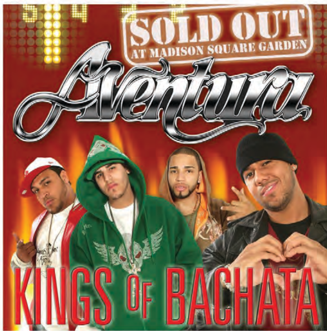
Figure 2: CD cover for Aventura’s Kings of Bachata: Sold Out at Madison Square Garden (2007). Note the hip hop fashion

Most Dominican Americans feel primarily Dominican, but they come to also identify as American, Hispanic, and Latino. They grow up speaking Spanish at home, but English in school. Some grow up listening to Black American genres of music such as R&B and hip hop, but most are attached to the bachata and merengue of their parents. Despite a growing identification with African American culture, most migrants from Spanish-speaking countries and their descendants still prefer to identify themselves within mixed and ambiguous categories, such as Hispanic or Latinos, over mutually exclusive ones such as Black. 4