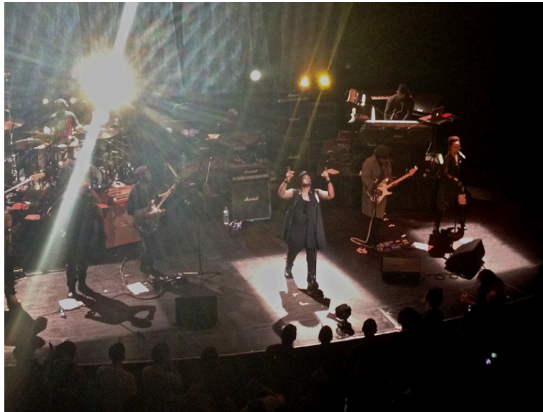
D'Angelo and the Vanguard perform at the Apollo Theatre, 7 February 2015.

Merging the syncopation of the hambone “body pat” with the “boom bap” kick and snare pattern, and a