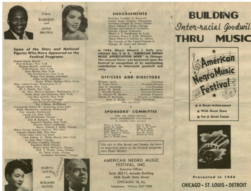
American Negro Music Festival: 1944 Program National Personnel Records Center Archival Programs Division

The American Negro Music Festival was ushered in confidently on a wave of Popular Front-era interracialism, was sustained by a spirit of national unity during the “good war,” and abruptly evaporated under the gathering clouds of Cold War anticommunism. Such a summary is undoubtedly true, though it only tells part of the story. Mul- len observes