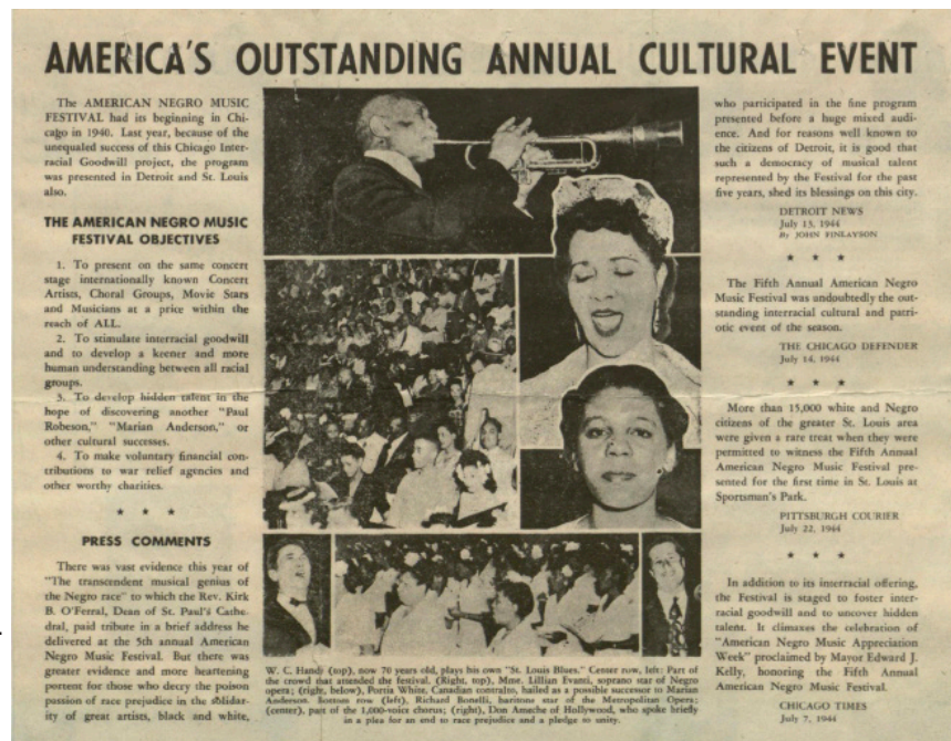
American Negro Music Festival: America's Outstanding Cultural Event Chicago Times, 7 July 1944 National Personnel Records Center Archival Programs Division

intent to rearticulate the model and message of the Chicagoland Music Festival but from a black perspective informed by uplift ideology. In its first three years, the ANMF was held at Soldier Field but in 1943 it was relocated—perhaps emblematically—deeper into the South Side to Comiskey Park, home of the Chicago White Sox. The Chicagoland festival’s populist message was echoed in the ANMF promise to present artists who “have reached farmers, housewives and laborers through the radio, performing music as varied and beautiful as the groups that make up America.” Yet despite declaring offerings “ranging from opera to jive,” the first years of the ANMF were dominated by concert music. The wedding of classical music and the spiritual was clear in the festival’s programming of such popular religious vocal ensembles as the Souther-