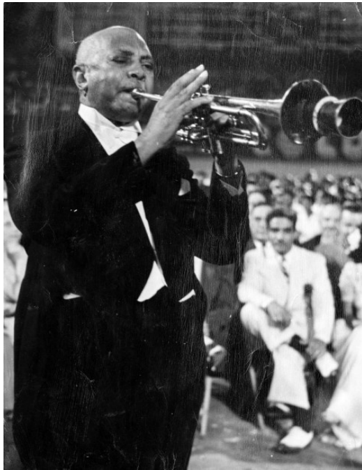
W.C. Handy at the American Negro Music Festival

The functions of public musical spectacle in 1940s Chicago were bound up with a polyphony of stark and sometimes contradictory changes. Chicago’s predominantly African American South Side had become more settled as participants in the first waves of the Great Migration established firm roots, even as the city’s “Black Belt” was newly transformed by fresh arrivals that ballooned Chicago’s black population by 77% between 1940 and 1950. Meanwhile, over the course of the decade, African Americans remained attentive to a dramatic narrowing of the political spectrum, from accommodation of a populist, patriotic progressivism to one dominated by virulent Cold War anticommunism. Sponsored by the Chicago Defender , arguably the country’s flagship black newspaper, and for a brief time the premiere black-organized event in the country, the American Negro Music Festival (ANMF) was through its ten years of existence responsive to many of the communal, civic, and national developments during this transitional decade. In seeking to showcase both racial achievement and interracial harmony, festival organizers registered ambivalently embraced shifts in black cultural identity during and in the years following World War II, as well as the possibilities and limits of coalition politics.