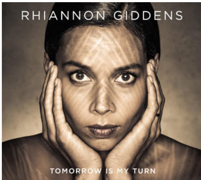
Tomorrow is My Turn Album by Rhiannon Giddens

Rhiannon Giddens' solo debut, Tomorrow is My Turn , is not only a brilliant expression of musicianship and a Billboard chart-topping album, but it is also an incisive folk narrative and survey of influential women in American music. With Tomorrow is My Turn , Giddens continues the important work she began with The Carolina Chocolate Drops 1 , re-envisioning gems of the past in a new context and for a new audience. The Chocolate Drops, an African American string band dedicated to rediscovering, reinterpreting, and reinvigorating string band music for a new generation, were initially inspired by visiting with and learning from the style of old-time North Carolina fiddler, Joe Thompson. Their 2010 album, Genuine Negro Jig , earned a Grammy for Best Traditional Folk Album.