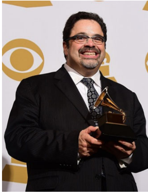
Arturo O'Farrill at the Grammys

Finally, it is now possible to subscribe to HISAM online, at hisam.org . Just follow the link on our homepage, and sign up to receive materials regularly sent out to our mailing list. If you haven't yet given us your email address, you may do so there. Always note that, although PDFs of our Newsletter articles can be downloaded from our site, and hard copies may be requested from our office, the full AMR experience is only available online!