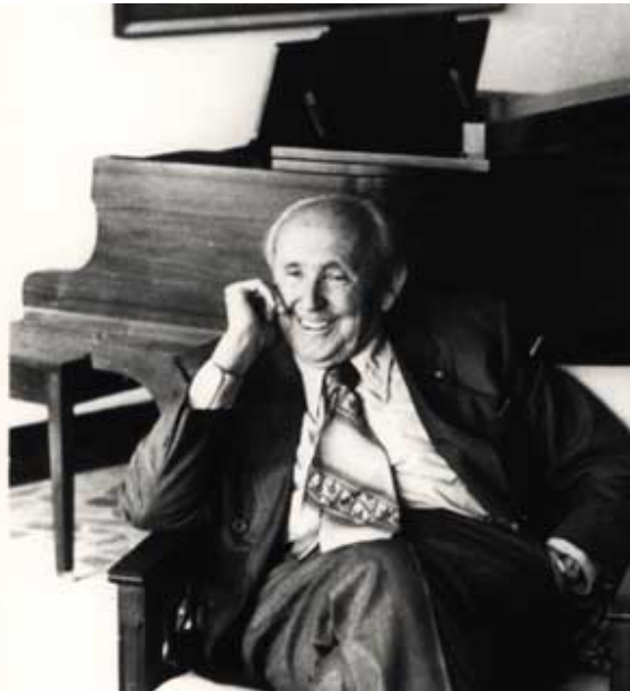
Roy Harris

nizations and re-orchestrations notated throughout the score. Through these annotations, one can see the evolution of his harmonic language and perhaps even the borrowing over time of pre-existing compositions. In these pages, Harris’s process is clear, though some aspects need deciphering, and the development of his language can be traced in a single staff. In addition to these bound score copies, which include all the symphonies of Harris, are boxes of loose manuscript paper. This is the most fascinating part of the collection, which ranges from sketches of a few bars of keyboard harmony to entire sections of large chamber and symphonic works.