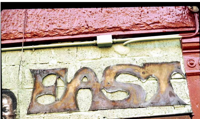
Sign over door at 10 Claver Place, Brooklyn

Which brings us to Pharoah Sanders. Very early in its history, The East inaugurated a weekend series called The Black Experience in Sound, which over a period of five years showcased some of the great