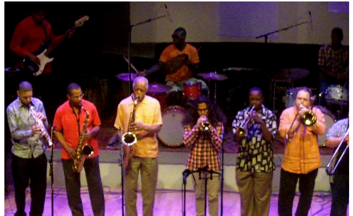
The York College Creative Ensemble at Vision Festival 2012