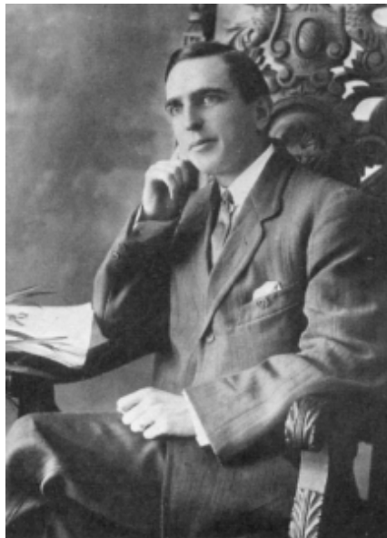
Joseph F. Lamb

For the next quarter-century, music remained a hobby for Lamb; he entertained his friends and composed for church minstrel shows. In 1949, he was lifted from obscurity by Rudi Blesh and Harriet Janis, who were researching the ragtime era and locating surviving figures from the period. They were surprised Lamb was not a black Midwesterner, but a white, Irish resident of Brooklyn; Lamb was astonished that anyone was interested in the ragtime he had composed decades earlier. After publication of the Blesh/Janis book They All Played Ragtime (1950) Lamb enjoyed a fame unlike anything he had experienced during his more active ragtime years. Ragtime aficionados visited and corresponded with him, interviewed and recorded him, featured him at festivals, and urged him to return to composing ragtime. He loved the attention.