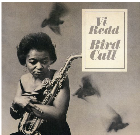
Vi Redd's first album Bird Call (1962)

In 1969, she joined the recording session of multi-instrumentalist Johnny Almond's jazz-rock album, Hollywood Blues , playing alto sax on two tunes. Her last recording was on Marian McPartland's Now's the Time , which was recorded immediately after Redd resumed her performing career. McPartland organized an "all-female band" for a jazz festival in Rochester, New York. On this live recording album, Redd played alto sax on several songs.