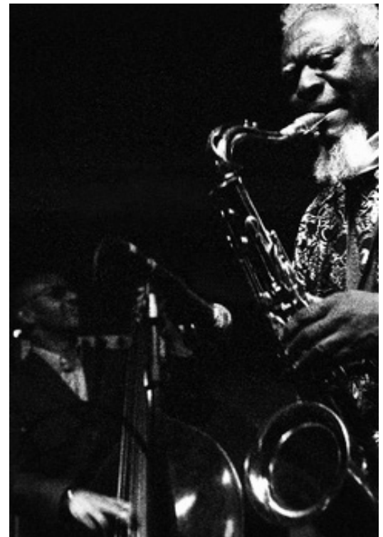
Pharoah Sanders performs at the Portland Jazz Festival in 2010

Some forty years later, in March 2010, Pharoah Sanders, a perennial